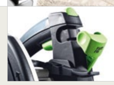
The FastFix saw blade change:

Viewing window and cutting indicator: The open construction and the viewing window on the inside provide a good view of the scribe mark and saw blade. The continuous cutting indicator also increases precision.